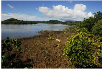
Mayotte Vasière des Badamiers