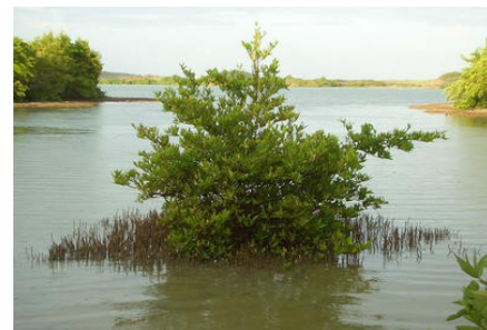
Martinique Les Salines lagoon