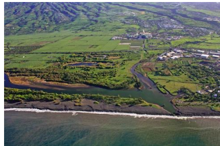
La Réunion Etang du Gol lagoon