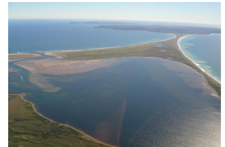
St Pierre & Miquelon Miquelon-Langlade Isthmus