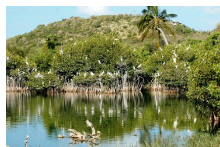
Saint-Martin Baie de l'Embouchure