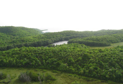
Guadeloupe Folle Anse marshes