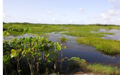
French Guyana Pripris de Yiyi